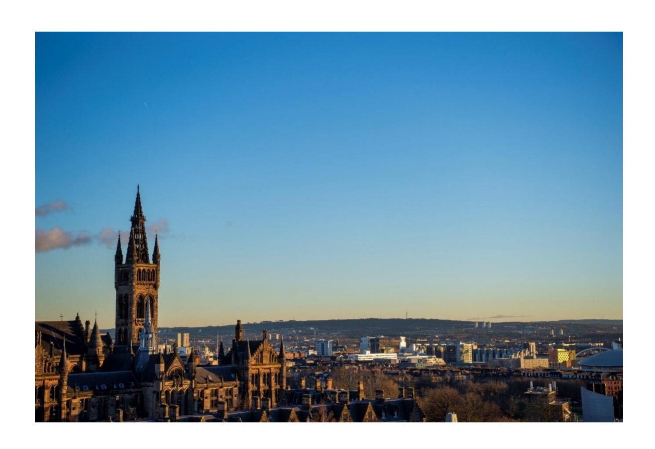
Course Handbook 2023 – 2024